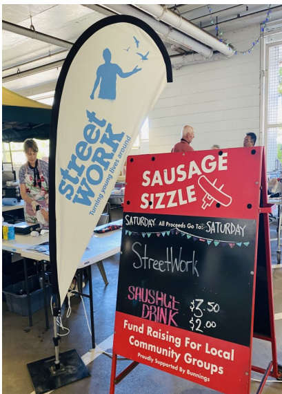
Our Parish Bunnings BBQ in support of Streetworks on Saturday 10 January!